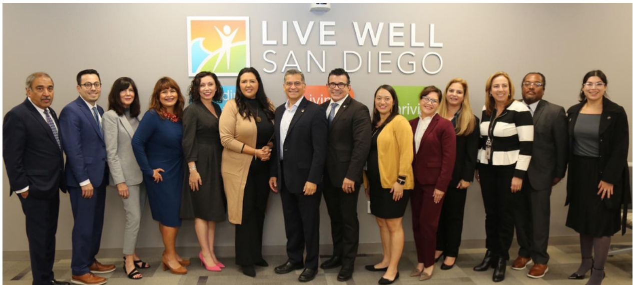
U.S. Department of Health and Human Services Secretary Xavier Becerra and I were joined by community partners for a powerful roundtable to uplift issues impacting our binational region, including mental health, immigration, access to health, housing & nutrition.

I have led this effort by advocating for the establishment of a first-of-its-kind central hub for our immigrant and refugee community in San Diego County, as well as supporting programs that ensure quality legal representation is available to immigrants facing removal.