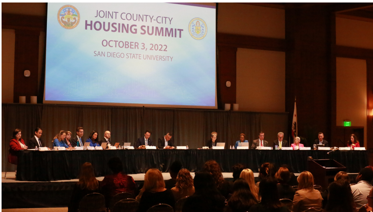
On October 3rd, 2022, my colleagues on the San Diego County Board of Supervisors and I joined City of San Diego elected leaders for a historic joint County-City Housing Summit to address the housing crisis impacting our communities.

As the safety net for our communities, the County has a key role in keeping our unhoused neighbors safe and ensure that residents and families in our region are protected and are able to stay in their homes. This year we have taken an innovative, public health approach to Housing and Homelessness - from protecting tenants, prevention, preservation and production - all from an equity lens.